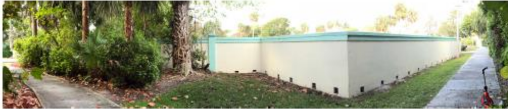
Actual view of Northeast corner (Walls A & B) and AIA pedestrian entrance