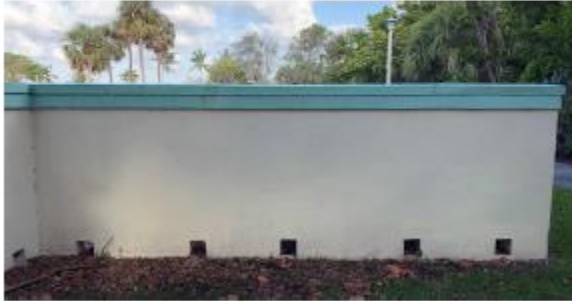
Closeup view of Wall B - Community Wall