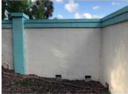
Closeup view of Wall A - Project Identification