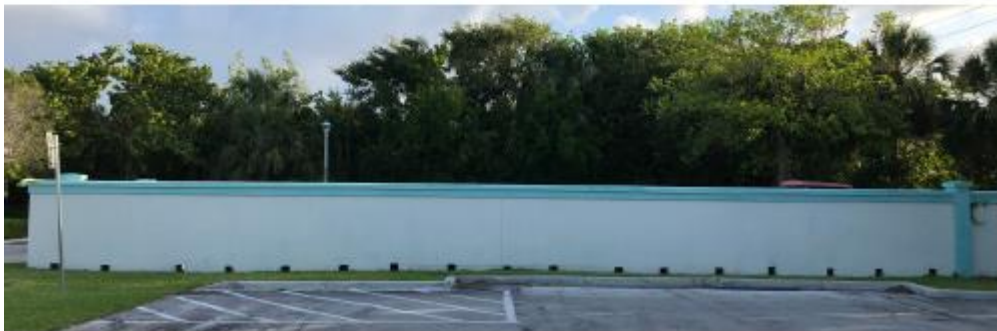
Actual view of South side (Wall E)