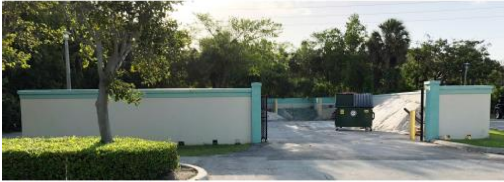
Actual view of West side (Walls D1 & D2)