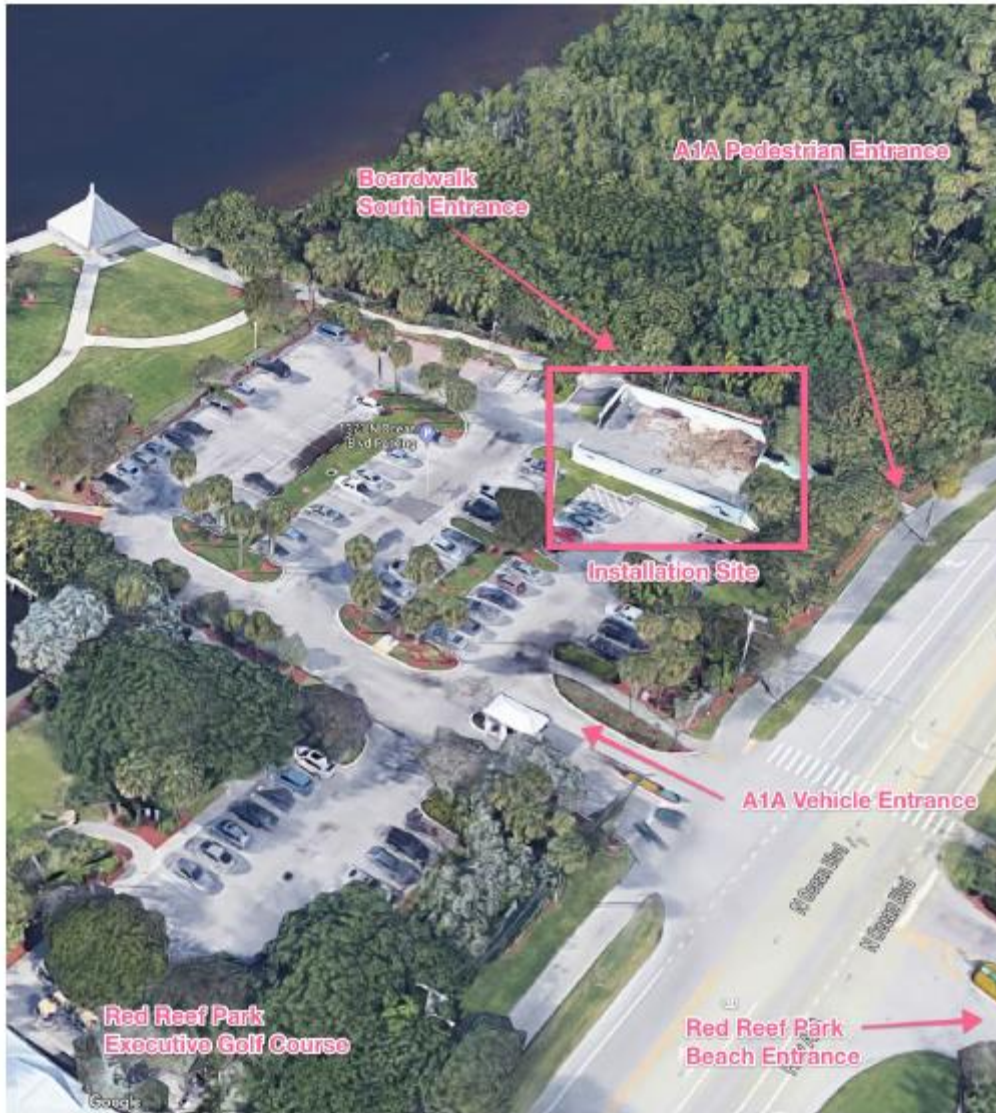
Aerial view of the site at 1801 N Ocean Blvd, Boca Raton, FL 33432.