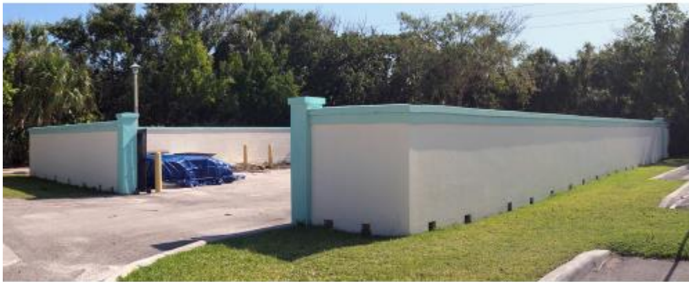
Actual view of Southwest corner (Walls D1, D2 and E)