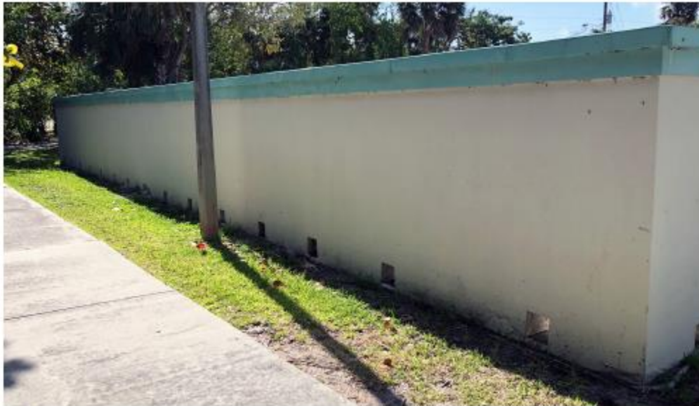
Actual view of North side (Wall C)