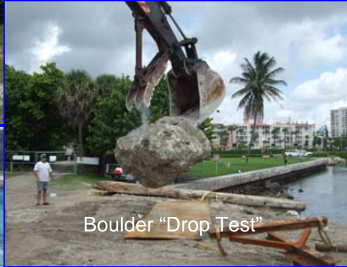
Boulder "Drop Test"