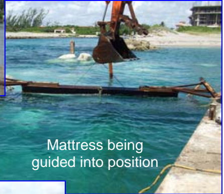
Mattress being guided into position