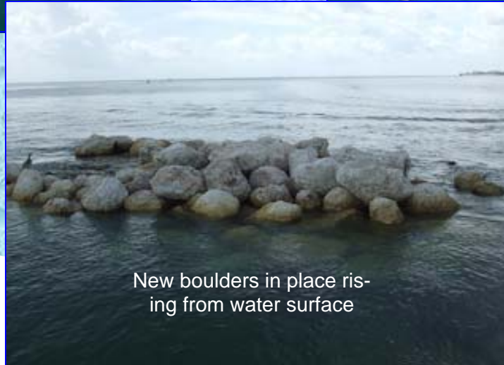
New boulders in place rising from water surface