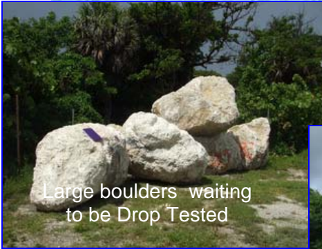
Large boulders waiting to be Drop Tested