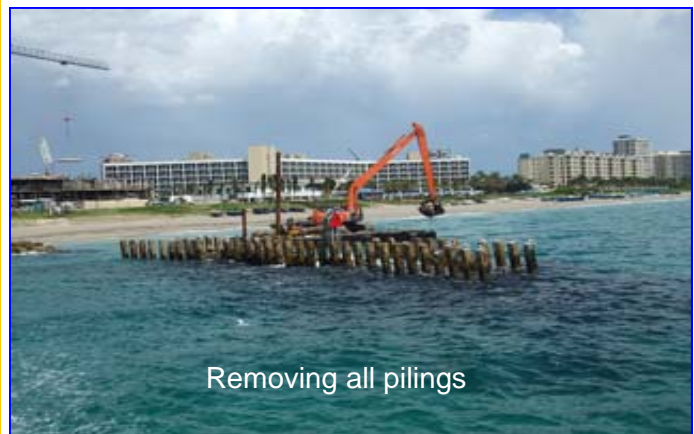
Removing all pilings

The reconstruction of the north jetty involves removing the crib structure and replacing it with a rubble-mound structure consisting of approximately 2,500 tons of boulders. The structure would be located slightly north of the existing crib structure to avoid stone moving into the inlet. A marine mattress foundation has been constructed to prevent scour and settlement of the structure. Construction commenced the week of July 14 th and the anticipated date for completion is October 2008 – depending on what this hurricane season has in store for us.