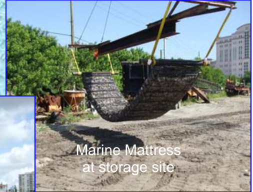
Marine Mattress at storage site