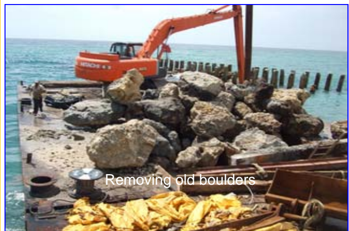
Removing old boulders